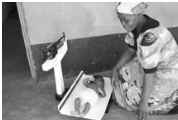
Many CPAR programs support women's health care in rural Africa. Here a traditional birth attendant assesses health of newborn.

on the day. It is a great way to educate the public about world health issues, and it is fun to be part of reaching a goal set by one's own group.